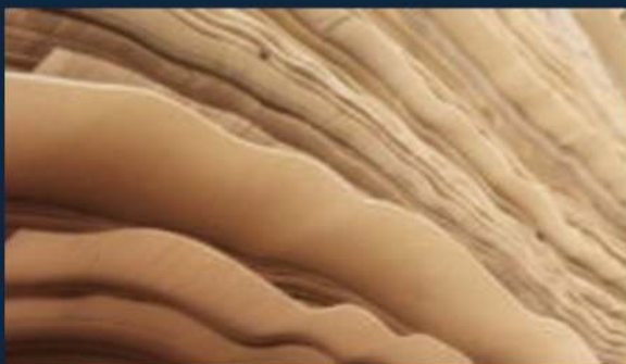
Best quality veneers for face and core