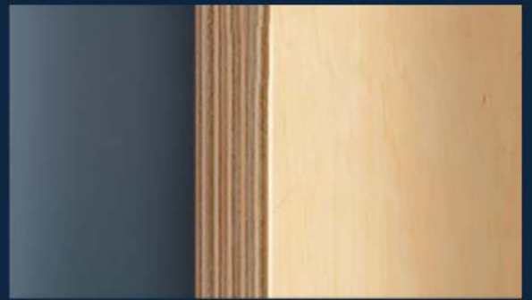
Consistently flat sheet