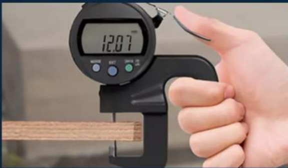
Tight thickness tolerances

Phone / WhatsApp: (513) 255-3103 Email: info@nfelitwood.com